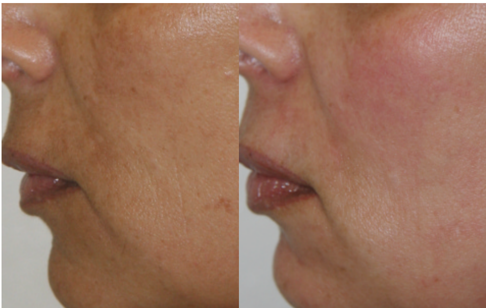
Picture 2: A 41 ys old patient with a mediterranean skin and moderate sun damage. Left-before treatment. Right-3 months after treatment. Notice the improvement in skin texture and colour. The fine wrinkles are almost erased from the cheek.

Some examples of the results are visible pictures number 2 and 3.