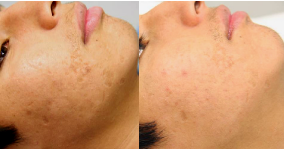
Picture 3: a 19 ys old Hispanic patient with hyperpigmented severe acne scarring. Left-before treatment. Right- 3 months after treatment (2 sessions, 1 month interval). The improvements in skin colour and scar remodelling are visible.